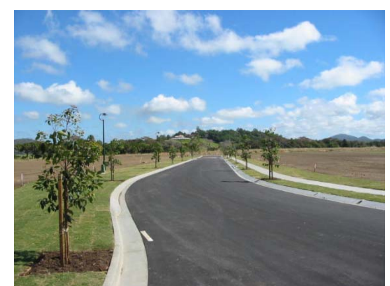
PHOTO 3 - TYPICAL STREET AVENUE