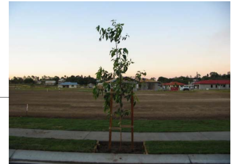
PHOTO 1 - STREET TREE TYPE 2