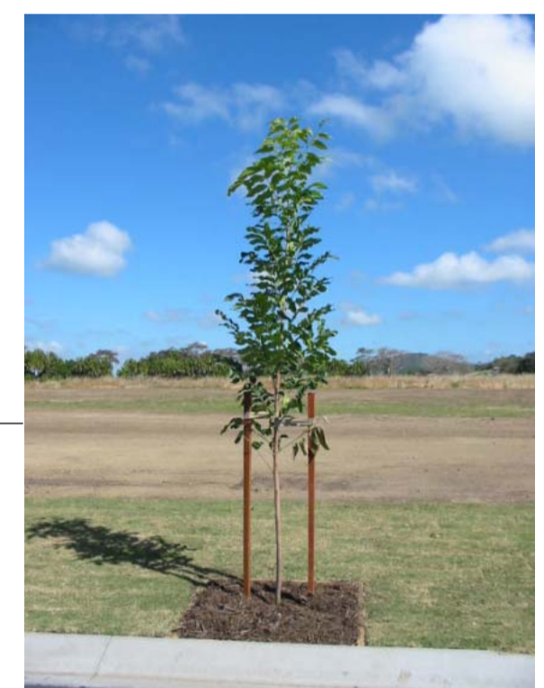
PHOTO 2 - STREET TREE TYPE 1